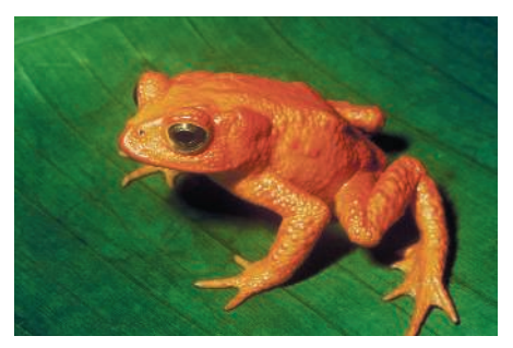
Early target. Some mountain-dwelling amphibians are already feeling the heat.

The disturbing message on the timing of global warming's effects comes in the IPCC chapters and technical summaries quietly posted online months after each of three working groups released a much-publicized Summary for Policymakers (SPM). An overall synthesis of the working group reports was released Saturday at the 27th session of